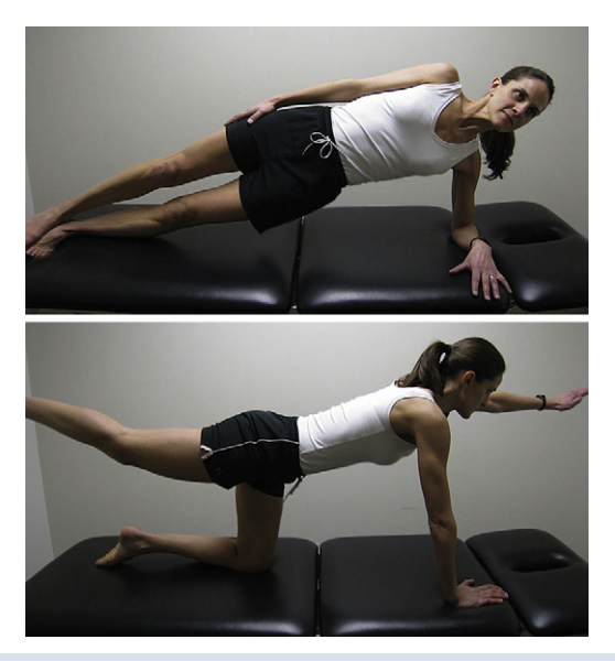
Fig. 2. Examples of stabilization exercises: side bridge (above) and bird dog (below).

Spinal manipulation is generally defined as the application of a high-velocity, low-amplitude thrust to a joint, which frequently results in an audible "crack" or cavitation [73]. The clinical outcomes associated with spinal manipulation have been the subjects of a great deal of scientific investigation. This research has resulted in several randomized clinical trials [74–77] and systematic reviews [16,78] demonstrating effectiveness for manipulation when compared with placebo or other interventions. However, other trials and reviews have failed to