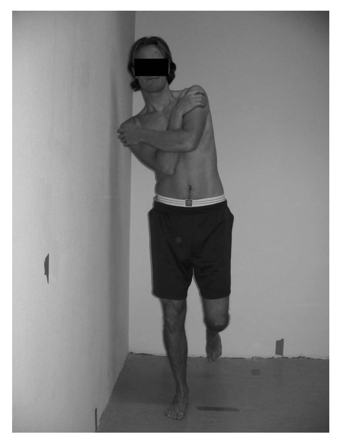
FIGURE 3. Frontal plane testing.

alternately lightly touched one shoulder and then the other against the wall. The head and pelvis were kept in the neutral position (Figure 5).