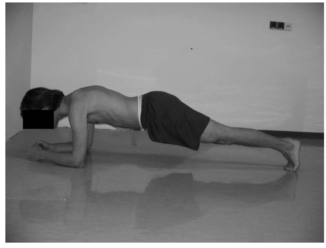
FIGURE 6. The bridge.

The ICCs for the interobserver are shown in Table 2. The results of the intraobserver reliability are shown in Table 3.