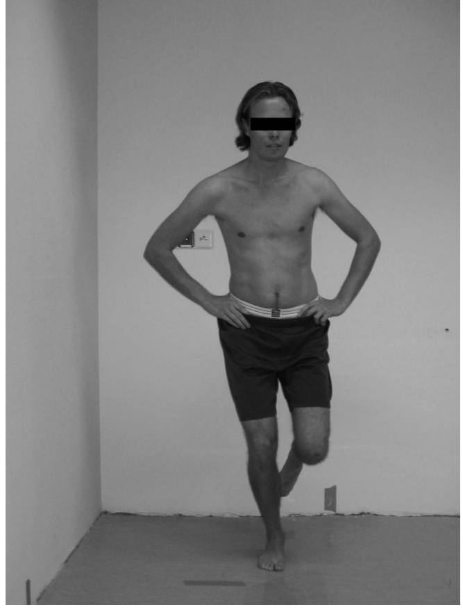
FIGURE 1. The unilateral squat.

For the lateral step-down, subjects stood on the test leg, which was positioned on the edge of an adjustable step, with