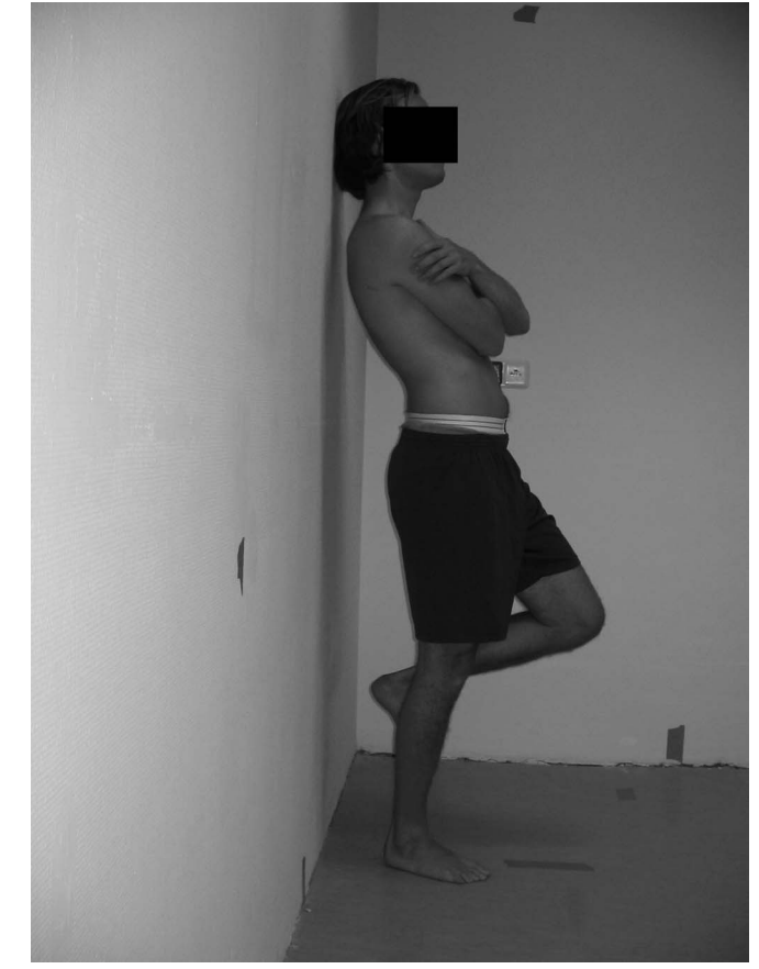
FIGURE 4. Sagittal plane testing.

and scored 1 test, they were shown the recordings for all 40 subjects in a different random order for the second test.