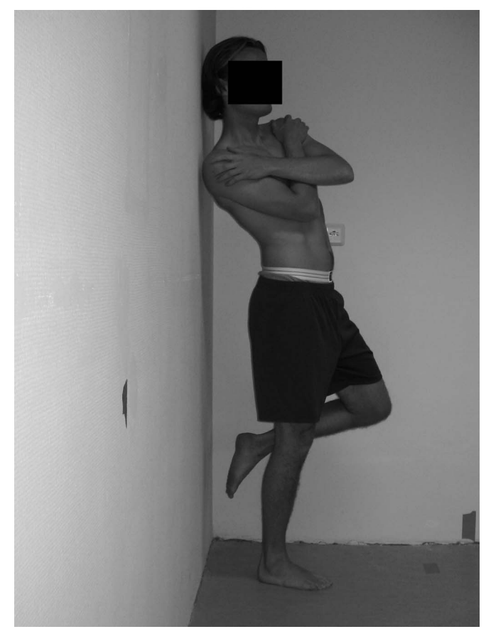
FIGURE 5. Transverse plane testing.

Percent agreement of all observers between the 2 observations was 0.46, 0.51, and 0.58 for the frontal, sagittal, and transverse plane tests, respectively, and 0.49, 0.47, and 0.53 for the unilateral squat, the lateral step-down, and the bridge, respectively.